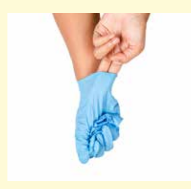
Hold the removed glove in the gloved hand