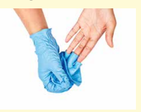
Remove the first glove without touching the skin of the hand