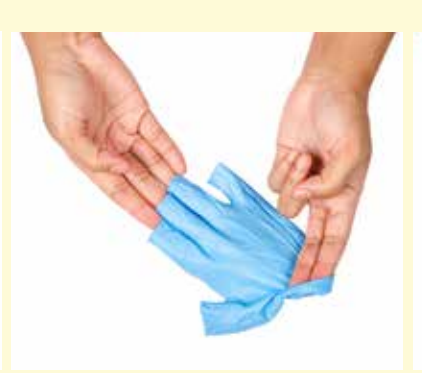
Remove second glove by rolling it down the hand and folding into the first glove