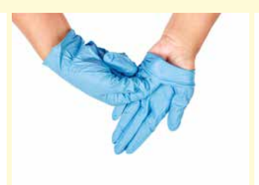
Peel away from the hand and turn the glove inside out