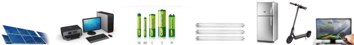
Table 1: Regulated Products

These regulated products are distinguished into regulated consumer products and regulated non-consumer products.