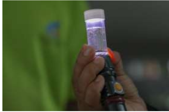
NEA dengue inspection officer collecting sample of mosquito breeding