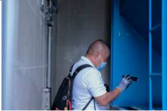
NEA dengue inspection officer checking bin centre at HDB estate