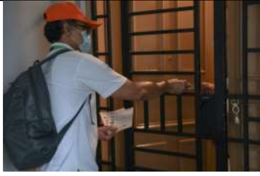
Door-to-door dengue prevention outreach