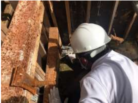
NEA dengue inspection officer collecting sample of mosquito breeding at Lian Beng construction site

High-resolution photos available upon request