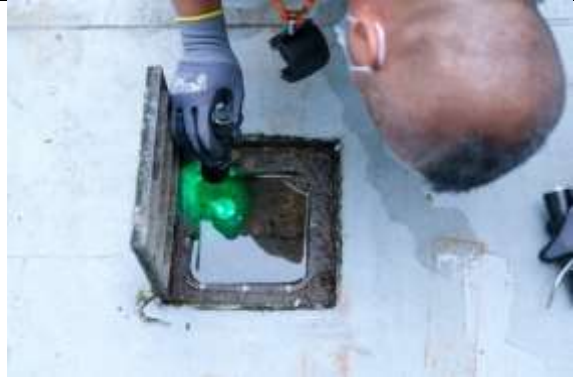
NEA dengue inspection officer checking lightning conductor pit