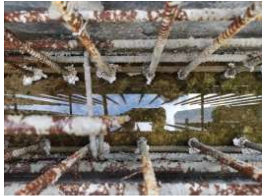
State of Lian Beng construction site during inspection