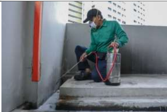
Oiling of drain along common corridor