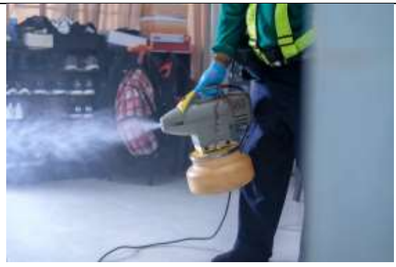
Ultra-Low Volume (ULV) misting in a residential home