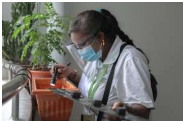
NEA dengue inspection officer checking flower pot