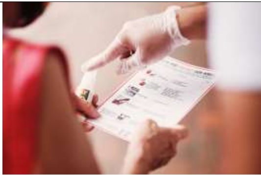
Dengue prevention outreach at town centres