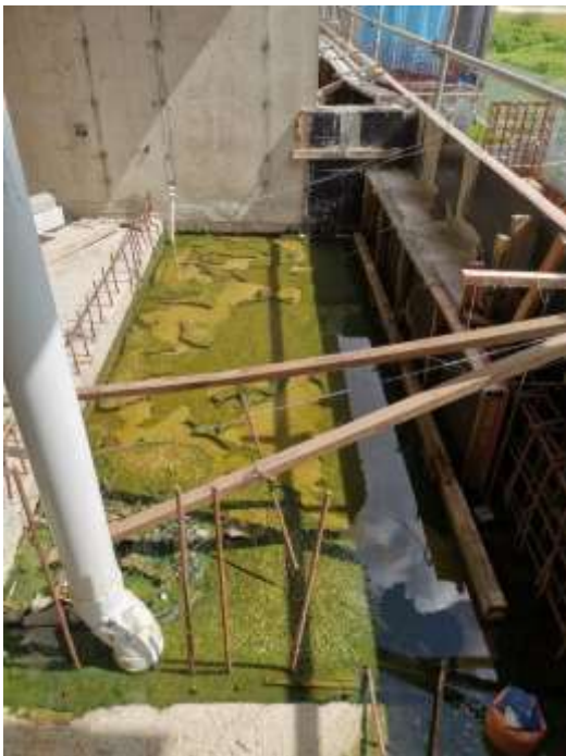
State of Lian Beng construction site during inspection