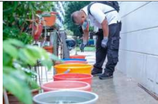
NEA dengue inspection officer checking pails of stagnant water