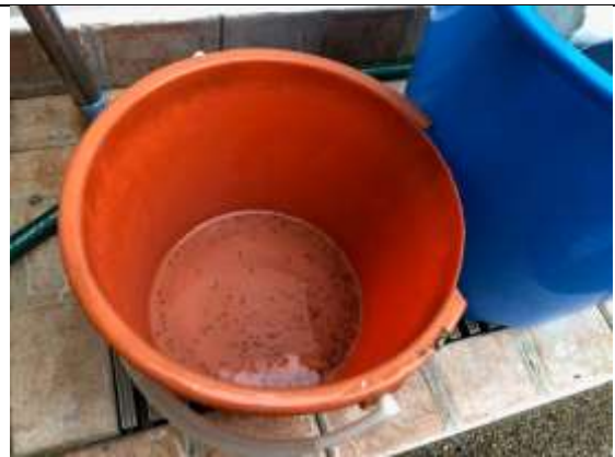
Sample photo of profuse mosquito breeding in a pail