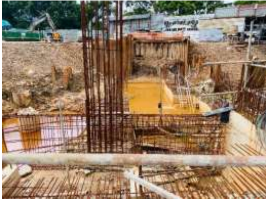
State of Lian Beng construction site during inspection