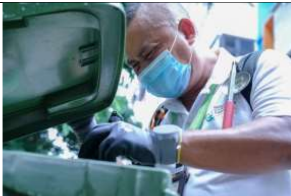
NEA dengue inspection officer checking refuse bin