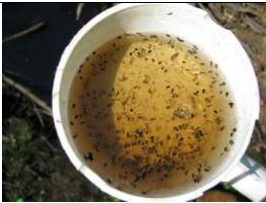
Sample photo of profuse mosquito breeding in a porcelain cup