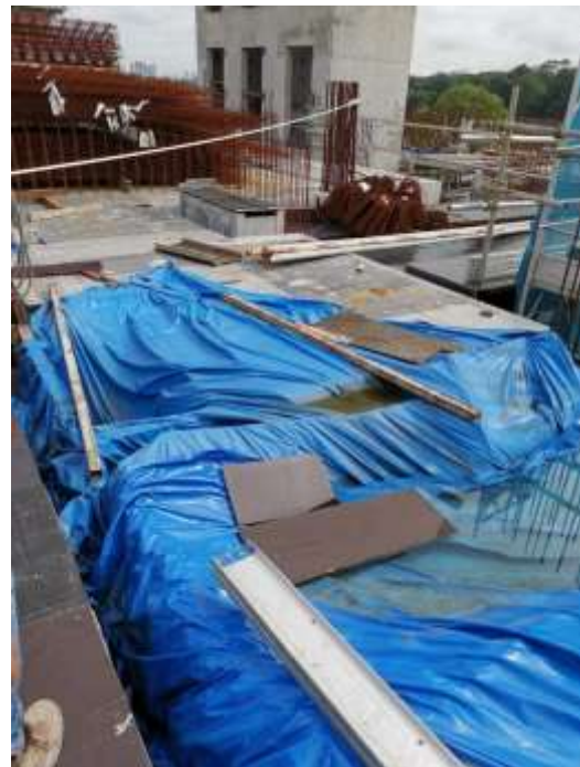
State of Lian Beng construction site during inspection