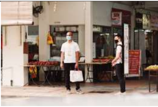
Dengue prevention outreach at town centres