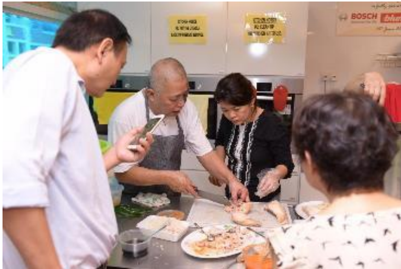
A hawker demonstrates techniques for making chicken rice. This is part of the “Hawker Fare Series”, where experienced hawkers share their culinary skills and knowledge with aspiring hawkers.