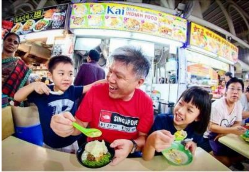
A father enjoying cendol , a local dessert, with his children at a hawker centre.