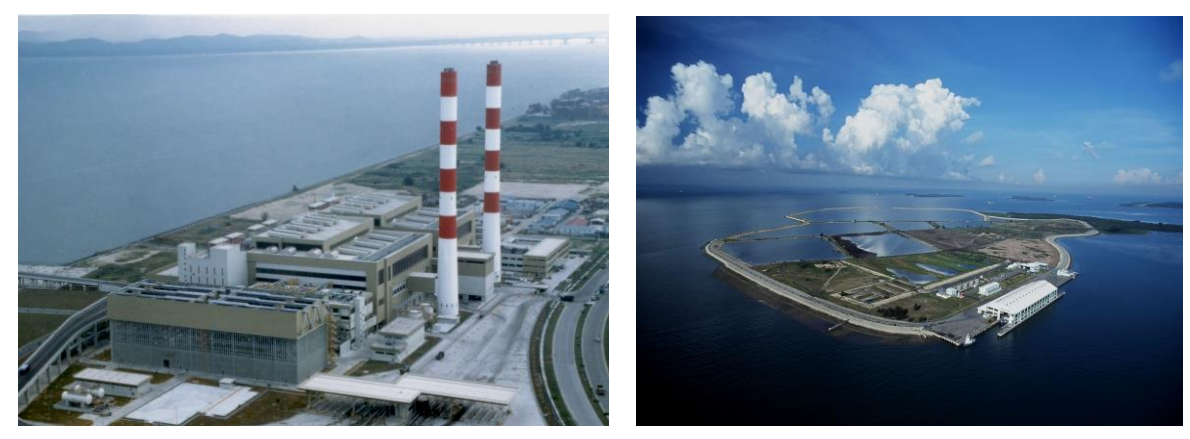
Tuas South Incineration Plant

If waste quantities continue to grow, there would be a need to build more waste-to-energy plants and offshore landfills. This presents a key challenge for land-scarce Singapore.