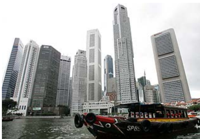
Participants of PEEL will get a chance to tour Singapore River on a bumboat.

FROM a scenic boat ride down the Singapore River to labs filled with live mosquitoes, the National Environment Agency is pulling out the stops to get the green message across.