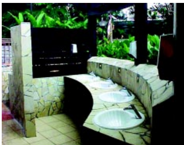
Newly repaired and refurbished toilet at Newton Food Centre.

Repair & refurbishment works for toilets at Newton Food Centre have been completed, while the works in the other five Centres are works-in-progress, expected to see completion by April 2001.