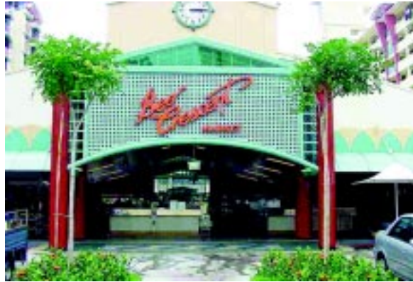
Newly upgraded Beo Crescent market.